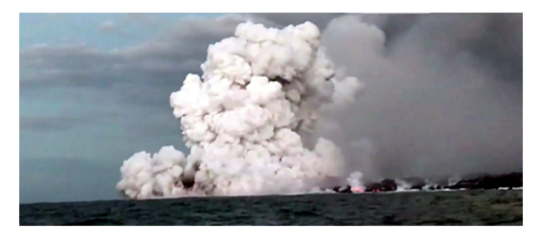
Figure 4. Lava bomb steam explosion at the Kilauea Volcano, Hawaii, July 17, 2018.