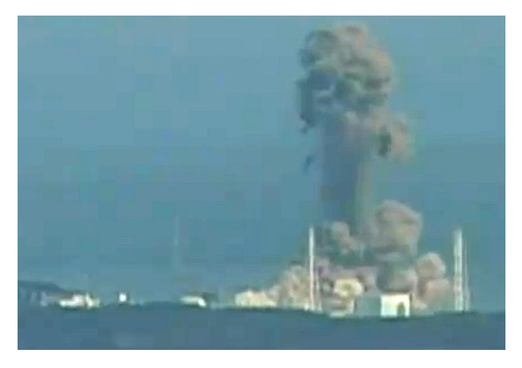
Figure 3. Possible steam explosion in the Unit 3 at the Fukushima accident.